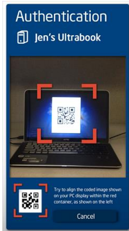
Figure 4: Pairing With Your PC