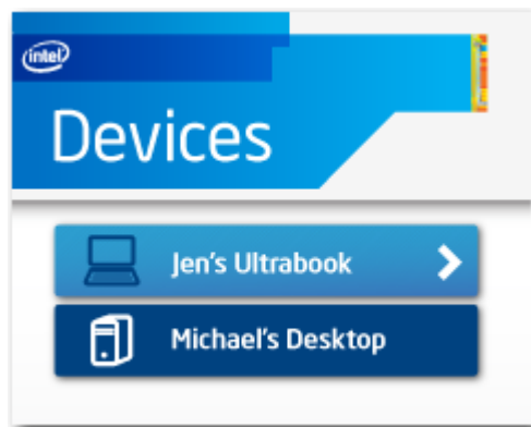
Figure 3: Devices View