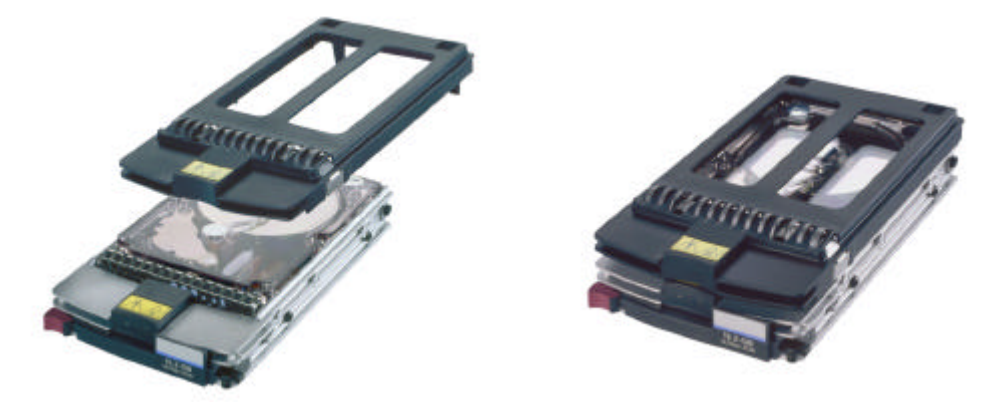
Figure 2. Compaq Hot Plug Drive Carrier Drive Height Converter

Compaq has designed a drive height converter (see Figure 2) that allows a 1-inch Ultra2 Universal Drive to be installed into a 1.6-inch drive bay, common in High Performance AlphaServers. The drive height converter simply snaps onto a 1-inch Universal Drive, providing seamless installation into the 1.6-inch drive bays of server or storage enclosures.