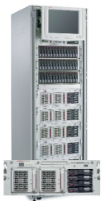
Compaq ProLiant DL580