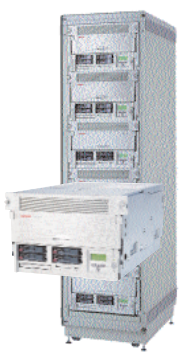
Compaq ProLiant 8500