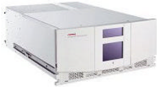
Table Top to Rack Mount Conversion Kits 231894-B22 MSL5026 TT-RK KIT,COMPAQ RACK

231892-B21 MSL5026SL,1 SDLT110/220DR,LVD,RM 231892-B22 MSL5026SL,2 SDLT110/220DR,LVD,RM