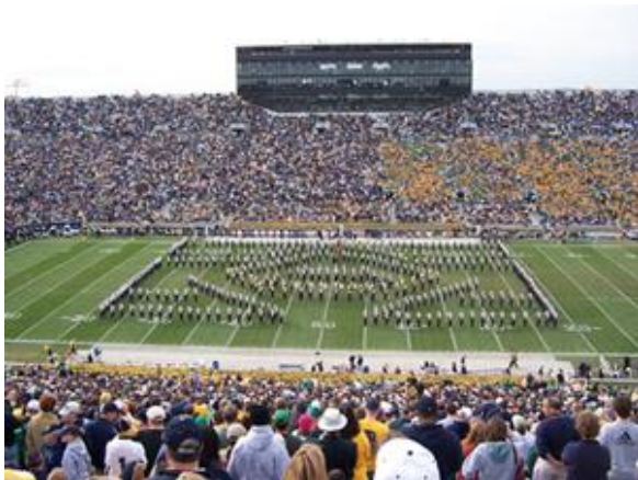
Increasing density of users