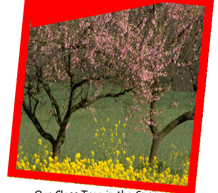
Our Class Tree in the Spring